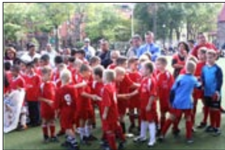
Team members share a global handshake