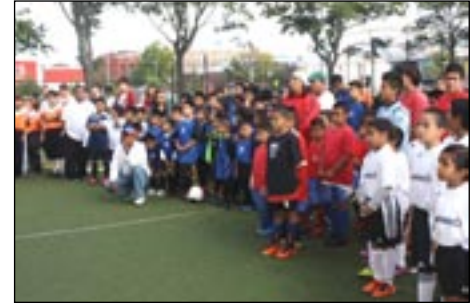
LA Liga team players learn the finer points of soccer