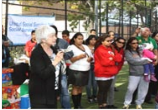
Watching the teams in action